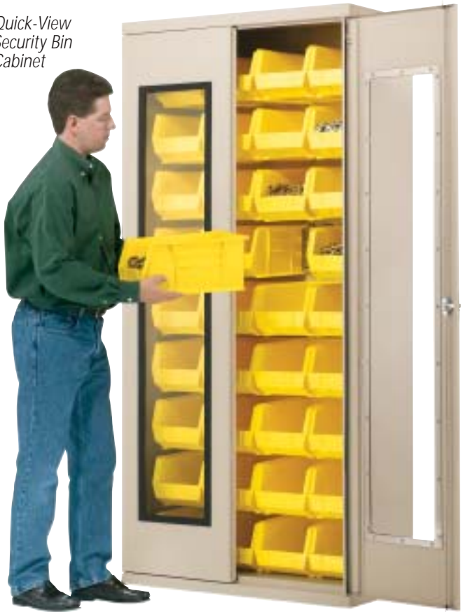
Quick-View Security Bin Cabinet

Clear windows allow you to identify contents while protecting parts from dust, damage, and theft. Constructed of 20-gauge steel with break-resistant, see-through Lexan™ inserts.