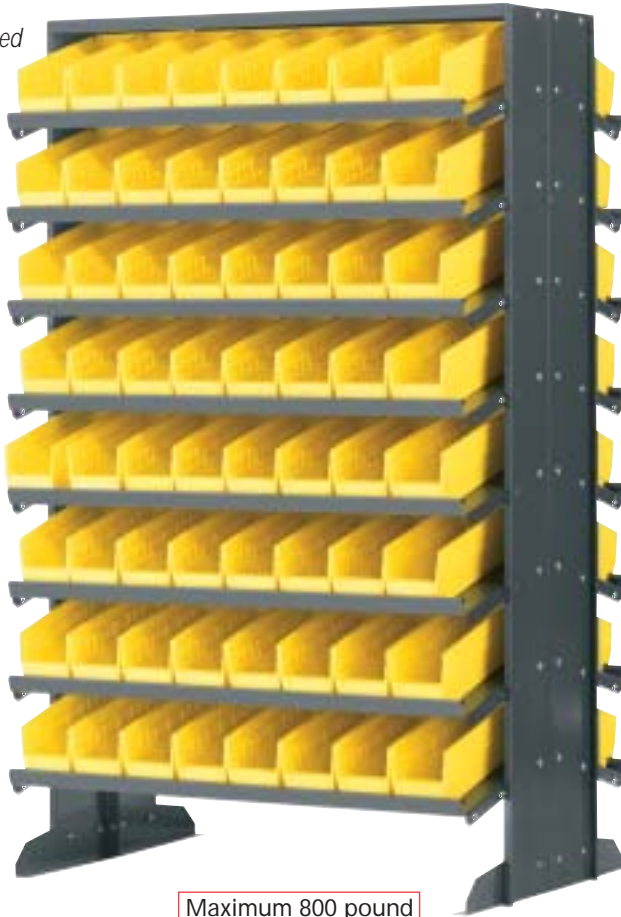
Double Sided Pick Rack