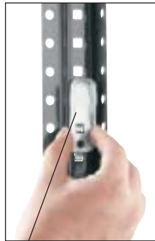
Easy Adjustment - Quickly change shelf height with compression clips

350 pound capacity per shelf when assembled and installed per instructions.