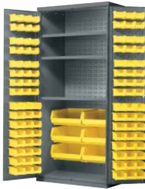
AkroBin Cabinet with 3 Shelves