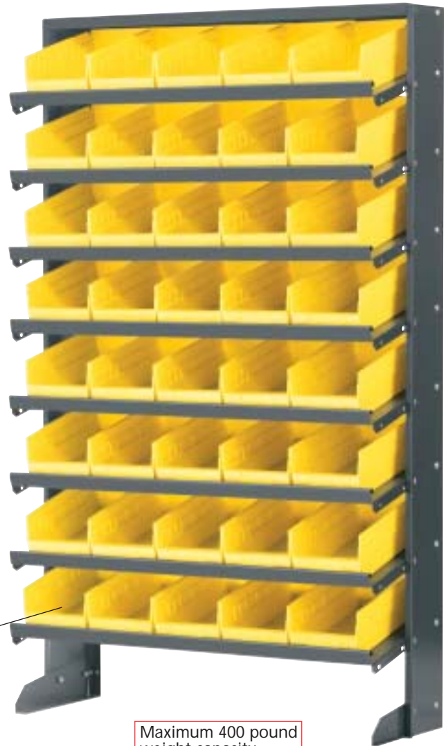
Single Sided Pick Rack