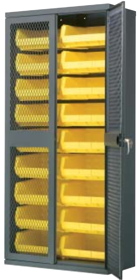
Secure View Security Bin Cabinet

The 16-gauge wire mesh Security Bin Cabinet protects contents from damage and theft. Constructed of 16-gauge steel.