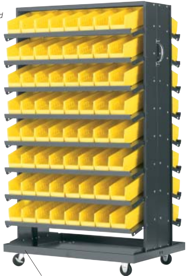
Double Sided Pick Rack & Mobile Kit

Improve workspace organization and efficiency with mobile rack and bin systems